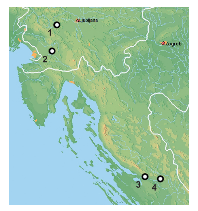
Fig. 1. Studied localities: 1 – Močilnik near Vrhnika (source of Ljubljanica River, Slovenia); 2 – Rakovski potok (below Mali Naravni Most near Rakovski Skocjan, Rakek, Slovenia); 3 – Krupa (spring of Krupa River, Croatia); 4 – Dramotići (spring of Zrmanja River, Croatia)

The shells of Boleana umbilicata (Figs 2–3) are broad, bulky, and relatively big, although in Belgrandiella kusceri (Figs 4–7) some shells are not smaller (Fig. 7).